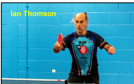
Two debutants for Cippenham in the opening Maidenhead League fixtures