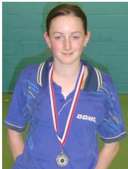
2nd in Cadet Masters; 10th in Junior Masters; Junior Open Champ