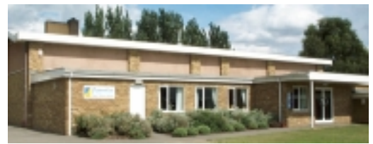
.. last look at the building as it once was!!

Sun 11th 10:30am Southern Region Coaches' Get-Together